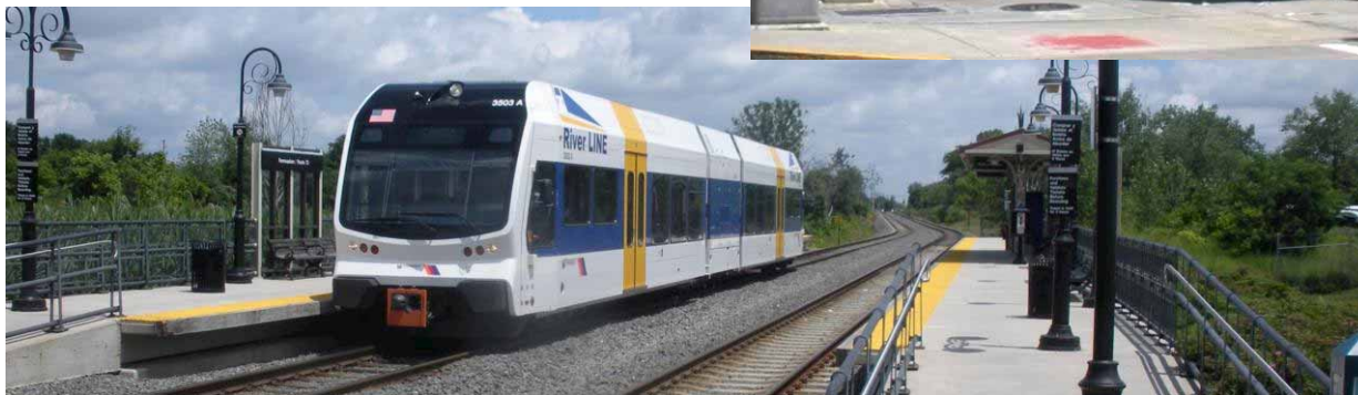
Camden River Line