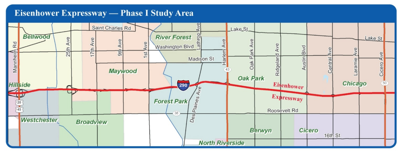
Figure 1-1 Location Map

The Eisenhower Expressway (I-290) Phase 1 study area is located in Cook County extending approximately seven miles from west of Mannheim Road (US 12/20/45) to east of Cicero Avenue (IL Route 50). See Figure 1-1. Serving as the western gateway to and from the city of Chicago and beyond, I-290 is a major link in the transportation network serving northeast Illinois. I-290 is the primary corridor connecting the rapidly growing western suburbs in Cook County, Du Page County, and the high employment centers of the I-88 Technology Corridor & the north-south I-290 corridor with Schaumburg. Immediately west of Mannheim Road is the I-290 Hillside Interchange where I-290, I-88 and I-294 converge. This network also serves important regional inter-modal freight railroad terminals, including the air cargo complex at O'Hare International Airport, as well as various modes of public transportation.