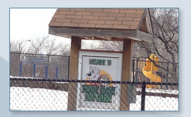
Circle Avenue at Lehner Street - Dog Park