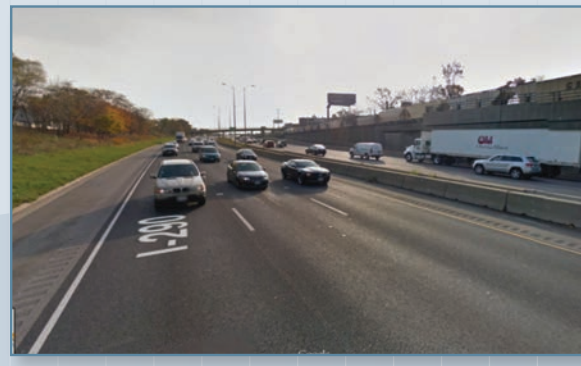
I-290 - Between CSX Bridge and Harlem Avenue - Facing East