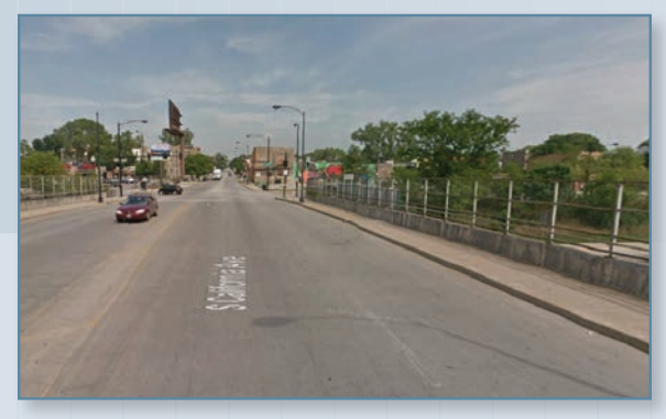
California Avenue Looking North