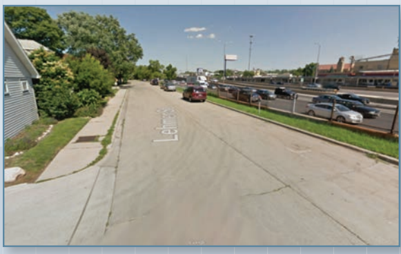
Lehmer Street Facing East between Circle Avenue and Harlem Avenue