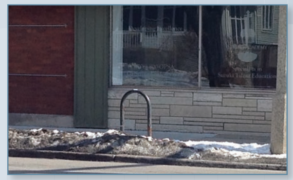
East of Lombard Avenue - Arts District Bike Rack