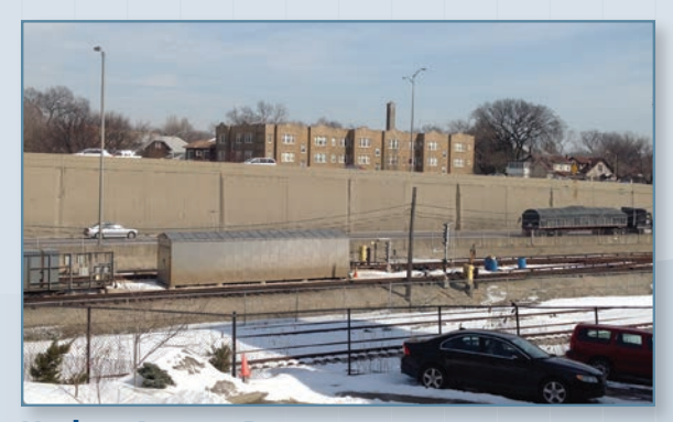
Harlem Avenue Ramp East Side of bridge looking North - retaining wall