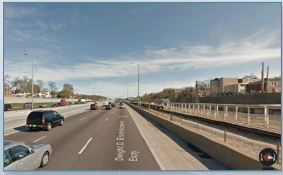
I-290 at Lombard Avenue Going Inbound