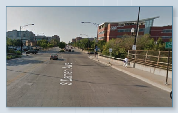
Damen Avenue Looking South