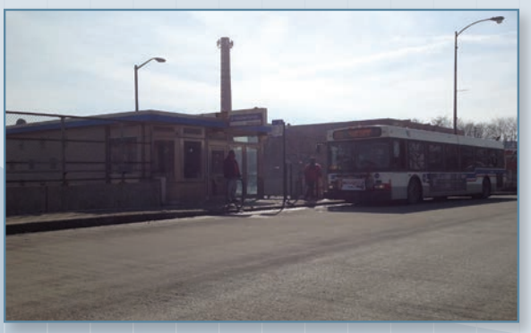
Homan Avenue over I-290 CTA Station