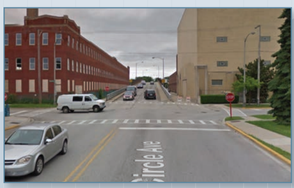
Circle Avenue Facing North towards I-290 overpass