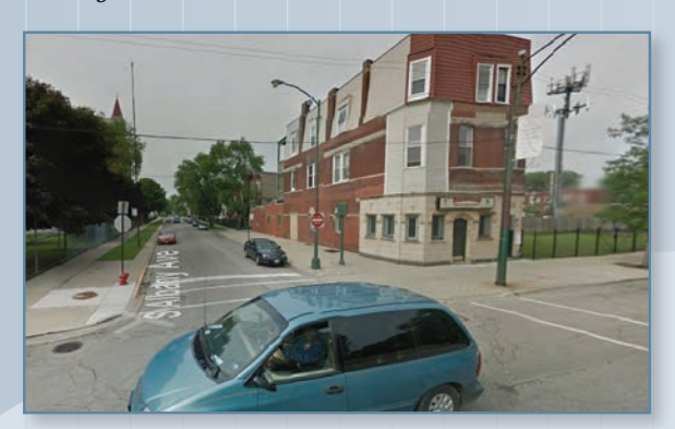
Albany Avenue Looking North