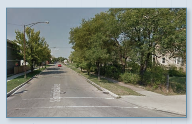
Springfield Avenue Looking North