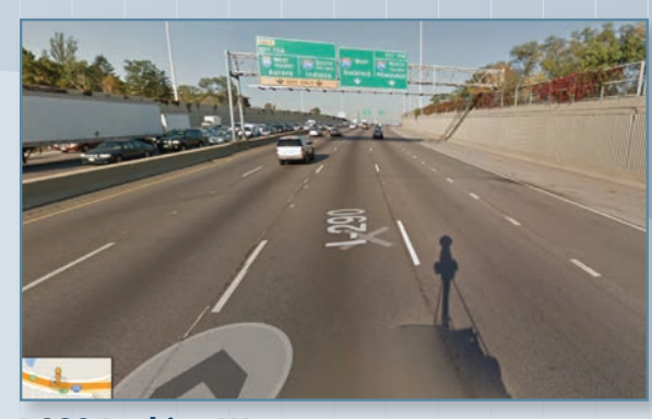
I-290 Looking West I-290 East of Mannheim Road - Retaining Walls