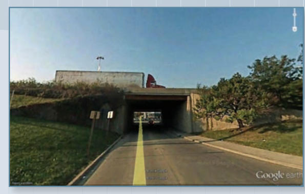
Hillside Drive Underpass of I-290