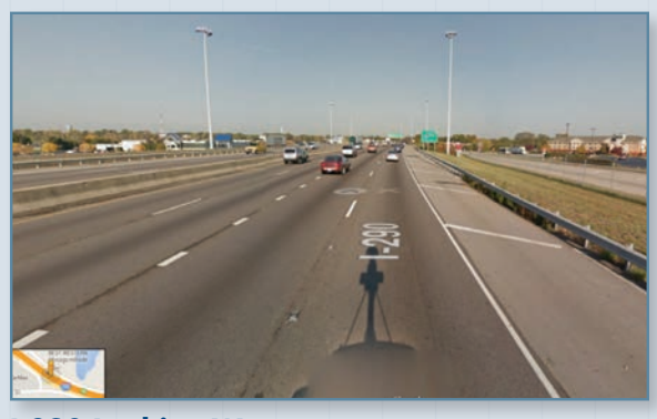
I-290 Looking West I-290 Westbound approaching I-88 Interchange