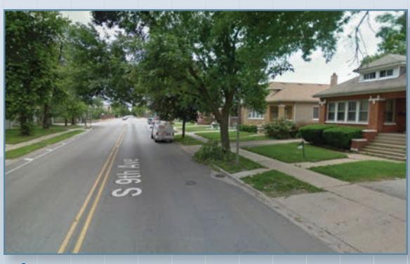
9th Avenue Facing South towards I-290 overpass