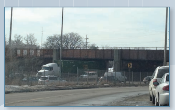
West of 25th Avenue Looking at IHB Railroad Bridge