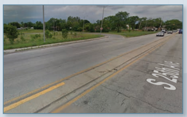
25th Avenue at I-290 Facing Southeast towards East Bound off ramp