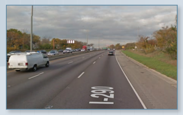
I-290 - Between Des Plaines River and Des Plaines Avenue - Facing West