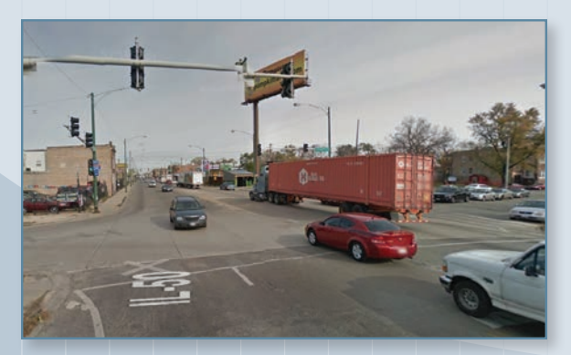
Cicero Avenue Looking North