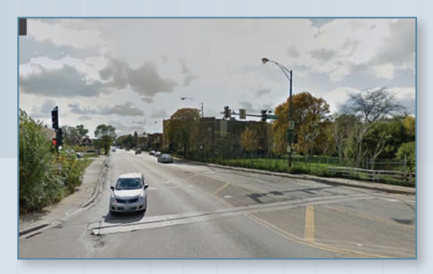
Kostner Avenue Looking South