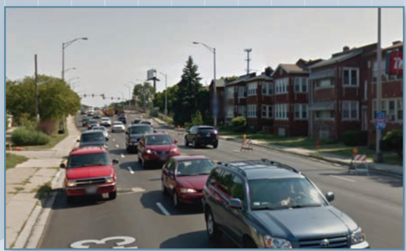
Lehmer Street - Facing West between Circle Avenue and Des Plaines Avenue