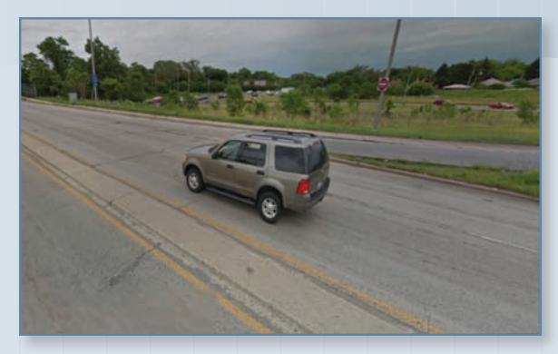
25th Avenue at I-290 Facing Northeast towards I-290