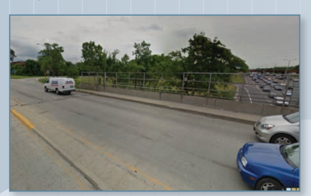
Indian Joe Drive Facing East towards IHB Railroad Overpass