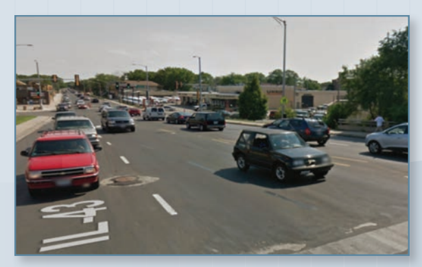
Circle Avenue Facing South towards Harrison Street