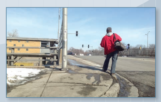
Austin Boulevard CTA Head Station