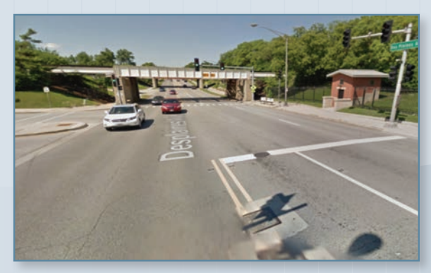
Des Plaines Avenue Facing North from CTA Kiss n Ride entrance