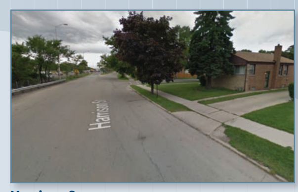
Harrison Street West of 17th Street facing West towards I-290 on-ramp