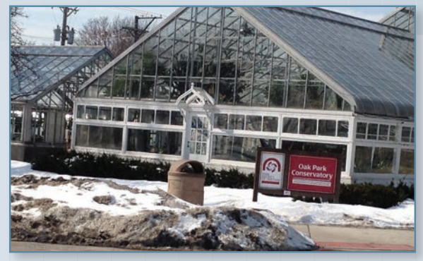
East Avenue Oak Park Conservatory