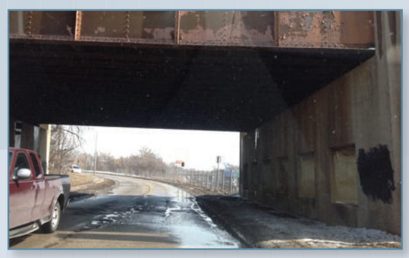
North Frontage Road Looking East at IHB Railroad Bridg