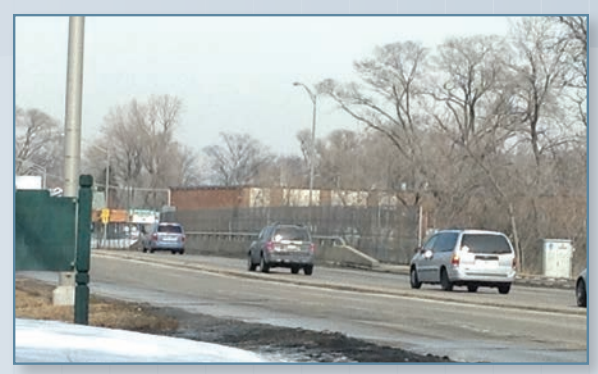
25th Avenue south of I-290 Looking Northeast - Bridge, wall and fencing