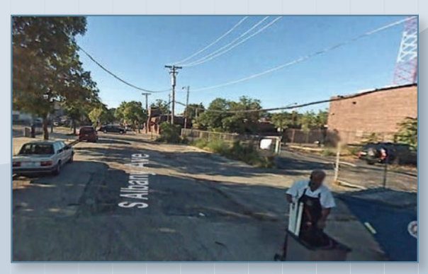
Albany Avenue Looking South