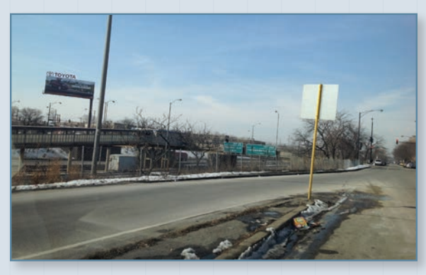
I-290 Exit Ramp to West Congress Parkway