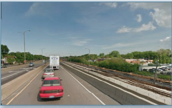
I-290 at Avenue Avenue Going Inbound