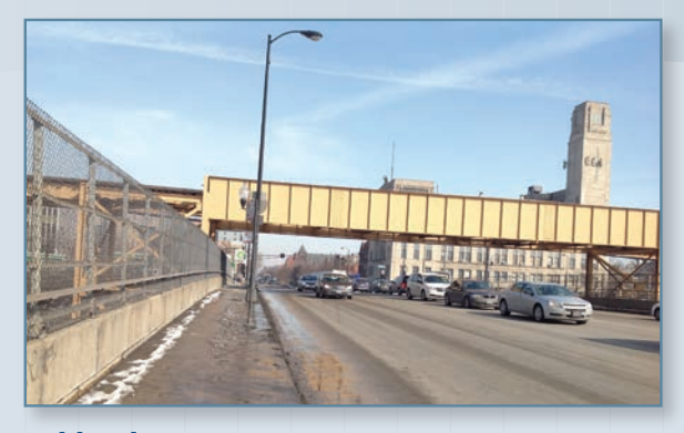
Ashland Avenue over I-290 Looking North - wall and fence