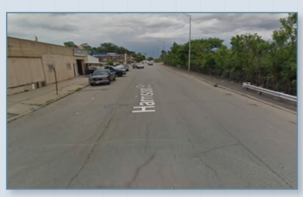
Harrison Street Facing East towards17th Avenue intersection