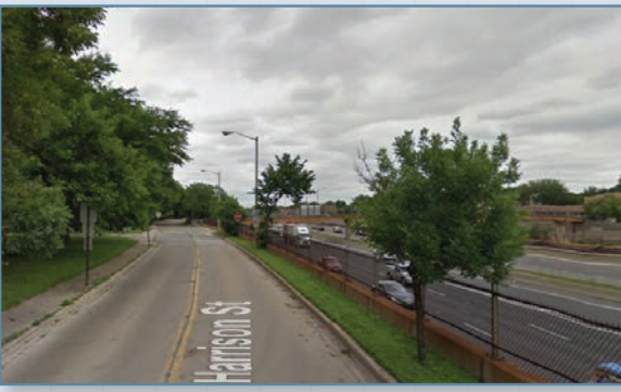
Harrison Street Looking West