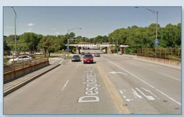
Des Plaines Avenue Facing North from I-290 overpass