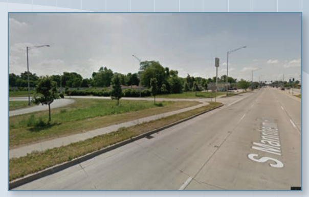
Mannheim Road Looking Southeast