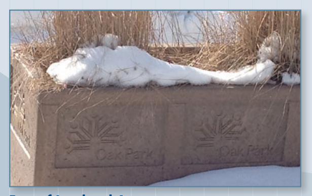
East of Lombard Avenue Planter