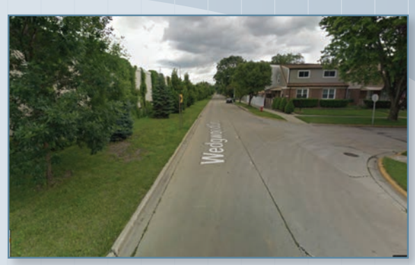
Wedgewood Drive Looking East - Noise Wall