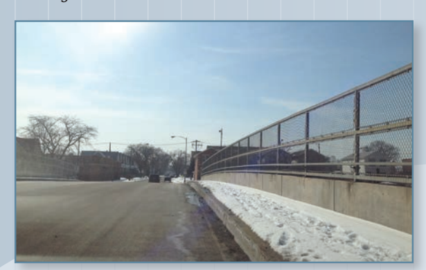
Keeler Avenue over I-290 Bridge, sidewalk and fence