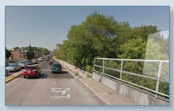
Harlem Avenue Looking North at East Side of Road