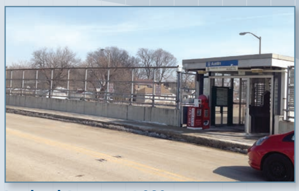
Lombard Avenue at I-290 CTA Station