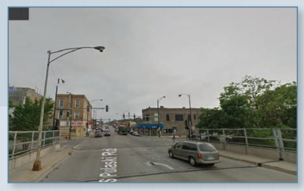
Pulaski Road Looking South