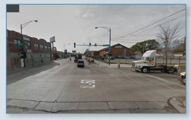
Cicero Avenue Looking South