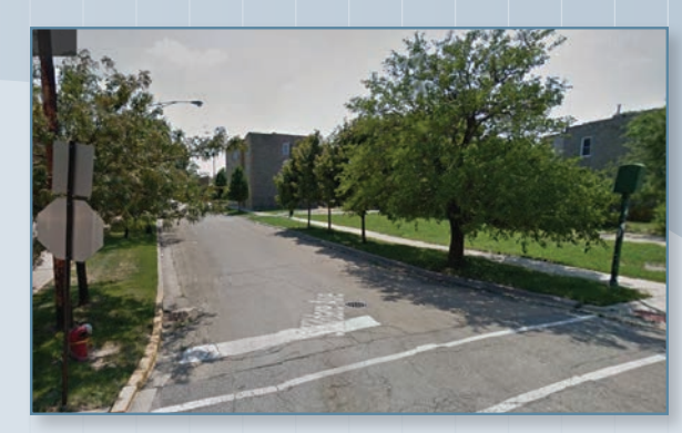
Kildare Avenue Looking South