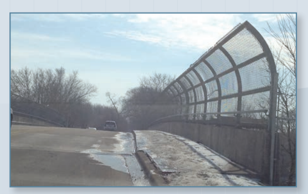
Bellwood Avenue Bridge, sidewalk, wall and fencing over I-290