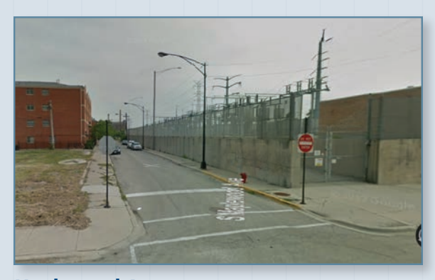
Maplewood Avenue Looking South