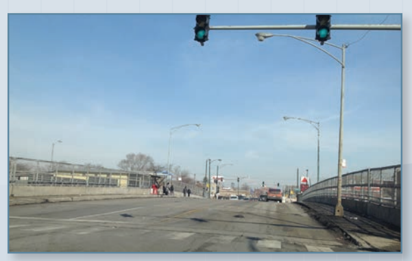
Pulaski Road over I-290