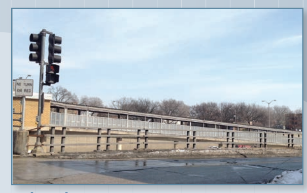
Oak Park Avenue CTA Ramp Home Avenue at Garfield - Railing