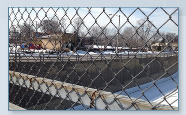
Lombard Avenue - Retaining wall and fencing