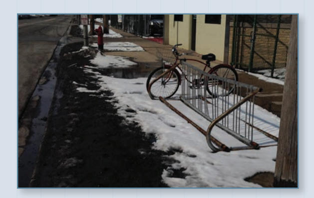
Circle Avenue - Bike Rack