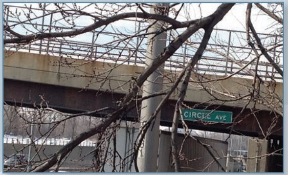
Circle Avenue View From North Frontage Looking West