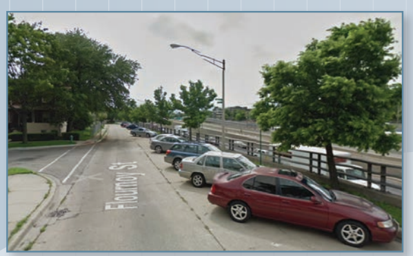
Flournoy Street and Lyman Avenue Looking West