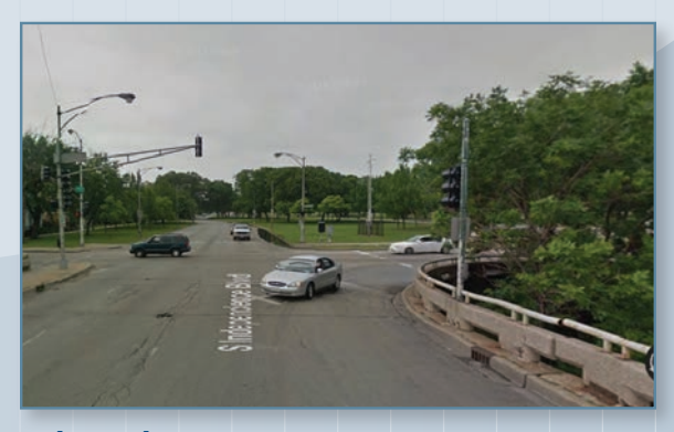
Independence Looking North