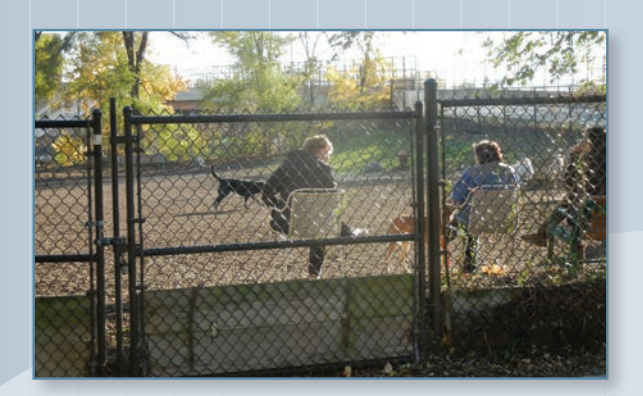
Circle Avenue at Lehner Street - Dog Park