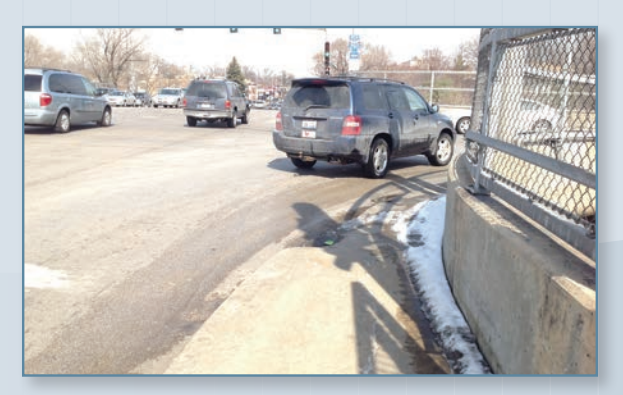
Harlem Avenue at I-290 North side of bridge - Narrow sidewalk