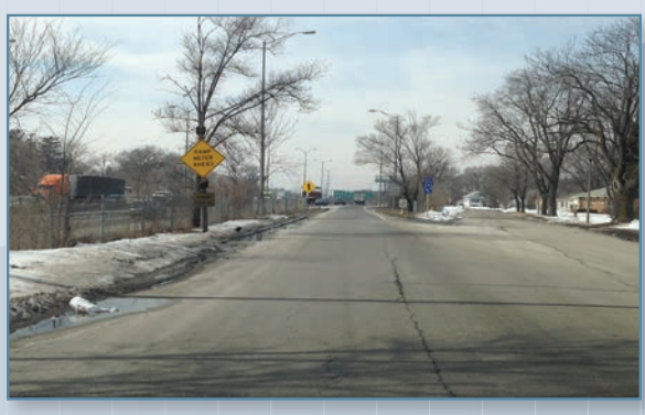
Bataan Drive Facing East towards 17th Avenue & I-290 EB off ramp