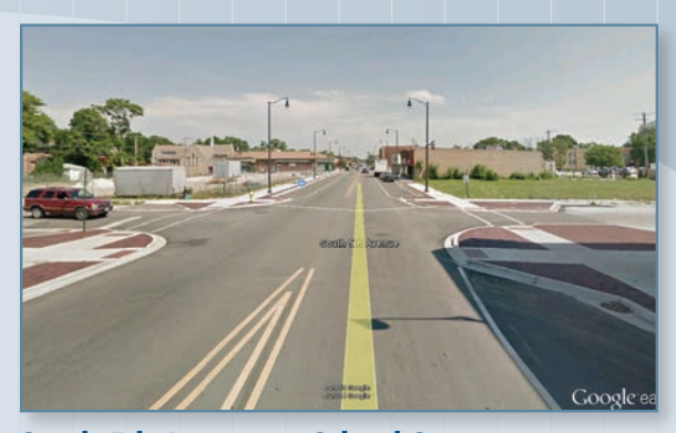
South 5th Avenue at School Street