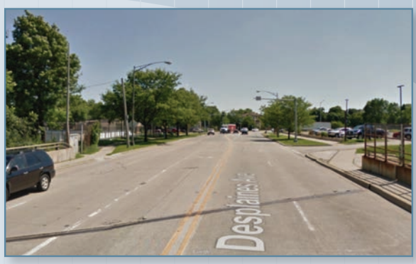
Des Plaines Avenue Facing South from I-290 overpass