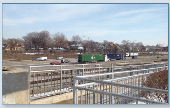
Home Avenue Pedestrian Bridge