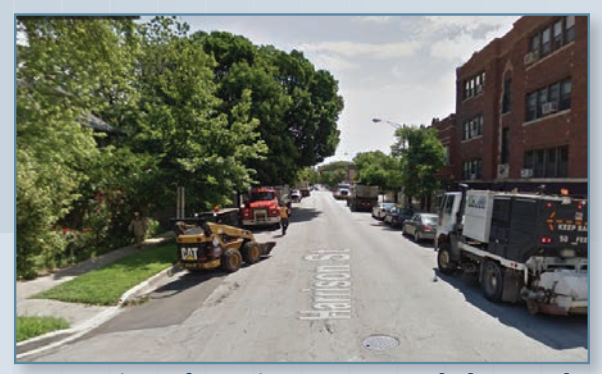
Intersection of Harrison Street and Elmwood Looking West