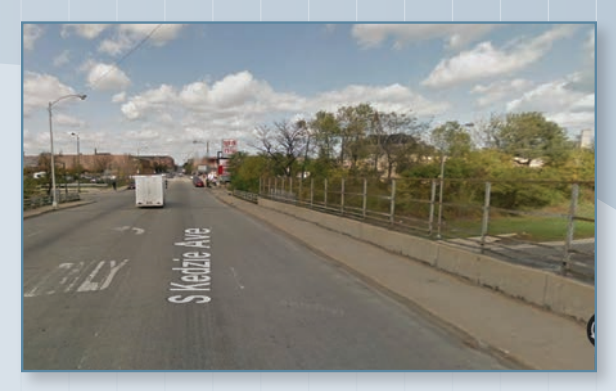
Kedzie Avenue Looking North