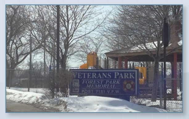
Circle Avenue - Veterans Park