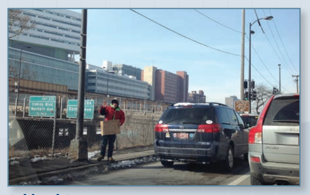
Ashland Avenue North Frontage - narrow sidewalk