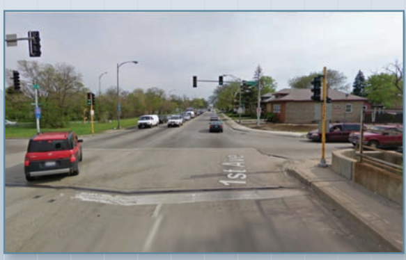
1st Avenue Facing South from I-290 overpass