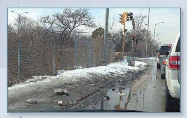
17th Avenue Approaching from East on the North Frontage