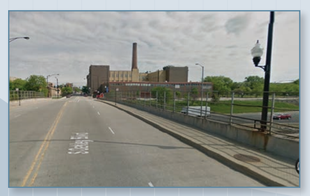
Oakley Boulevard Looking North