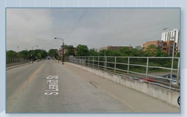
Leavitt Street Looking North