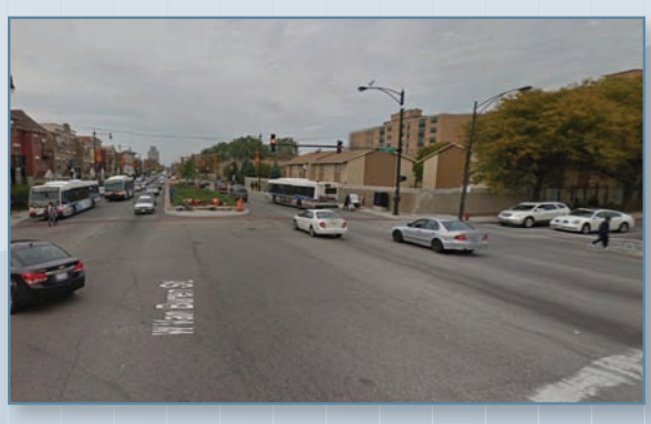
Western Avenue Looking North