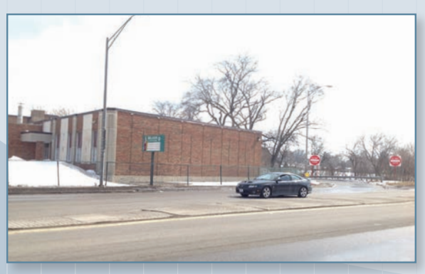
25th Avenue Northeast Quadrant - vacant school