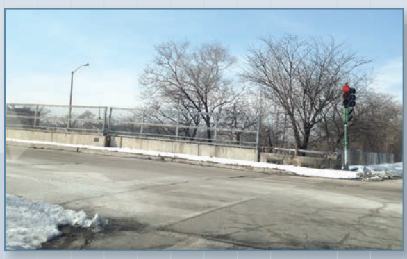
Keeler Avenue Bridge, sidewalk and fence