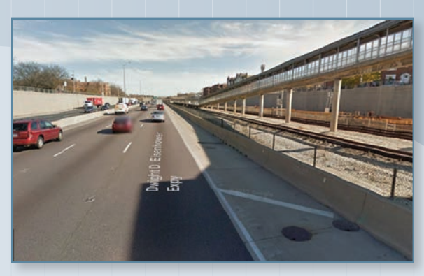
I-290 at Oak Park Avenue Going Inbound