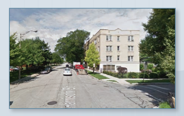
Intersection of Harrison Street and Elmwood Looking East