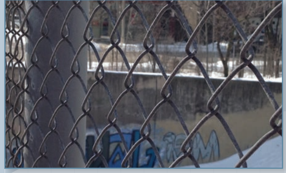
Ridgeland Avenue View of south wall from pedestrian bridge