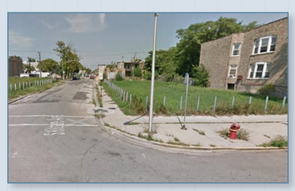
Kildare Avenue Looking North