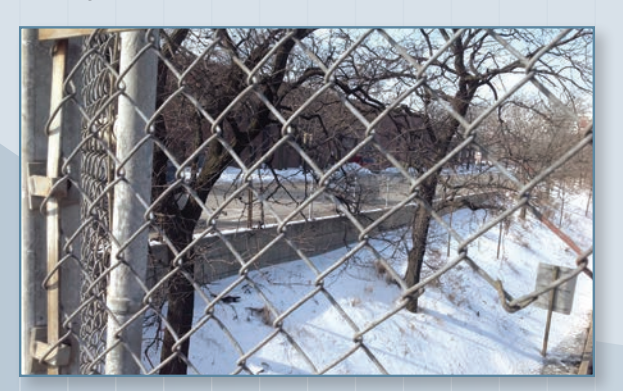
Racine Avenue Frontage Road