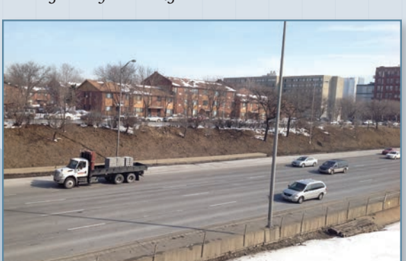
I-290 at Loomis Street Looking East