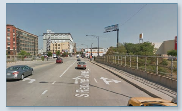
Racine Avenue Looking North