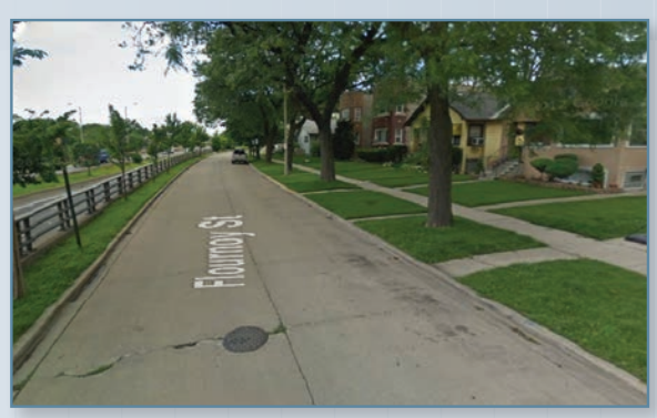
Flournoy Street Looking East