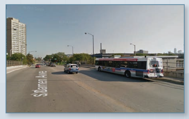
Damen Avenue Looking North