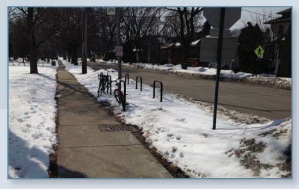
East Avenue Bike Rack