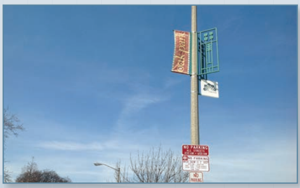
Austin Boulevard Banner