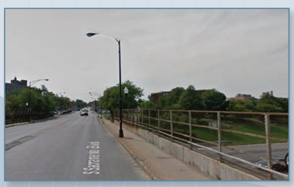
Sacramento Avenue Looking South