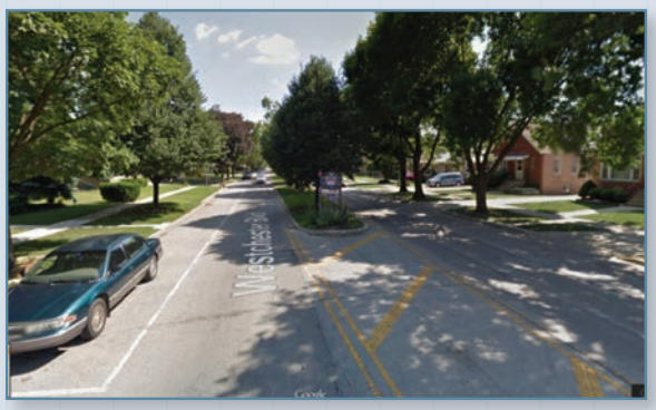
Westchester Boulevard Looking South