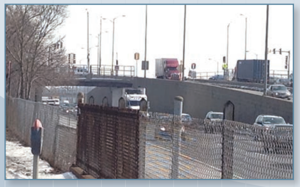
I-290 at Harlem Avenue North frontage looking east