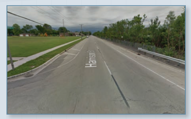
Harrison Street Facing East towards1st Avenue intersection