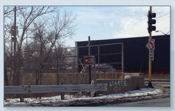
1st Avenue Guardrail, wall and fence