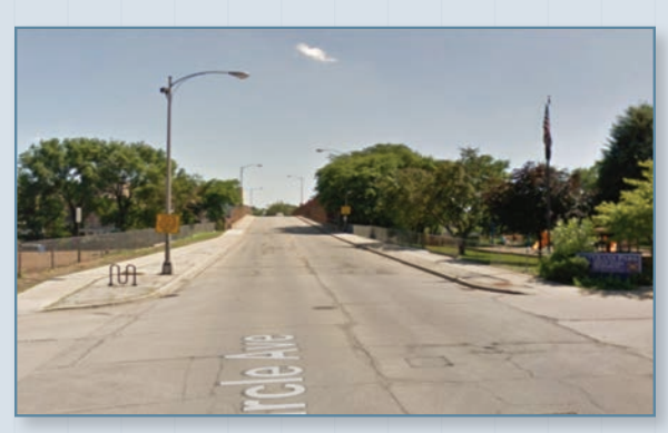
Circle Avenue Facing South - Intersection with Lehmer Street