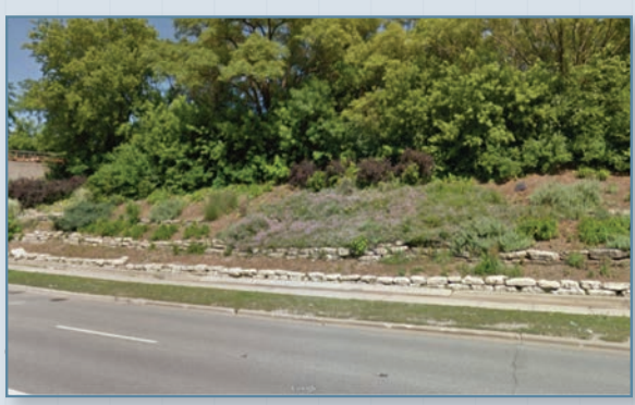
Des Plaines Avenue at Van Buren Street Facing South towards Van Buren Street