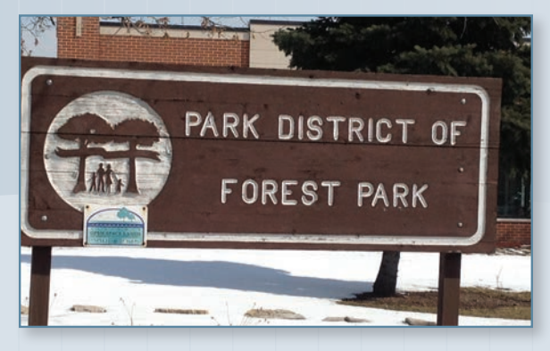
Des Plaines Avenue over I-290 Park District Signage