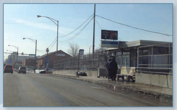
Cicero Avenue over I-290 CTA Station