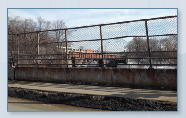
Des Plaines Avenue over I-290 Looking East at CTA bridge over I-290