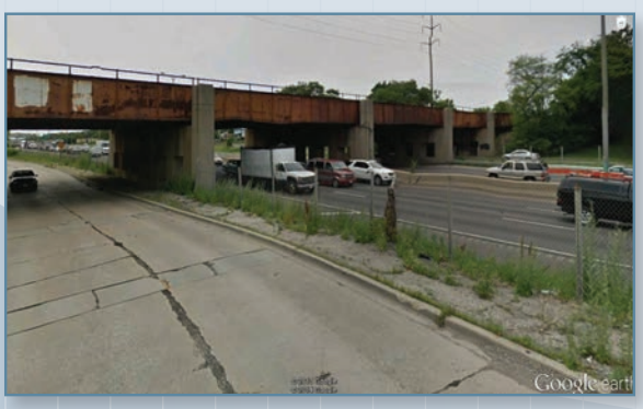
I-290 IHB R.R, Crossing