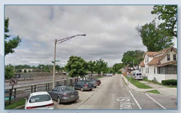
Flournoy Street and Lyman Avenue Looking West