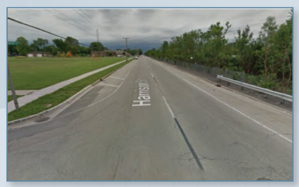
Harrison Street At 13th Avenue facing East