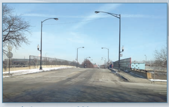
Loomis Street over I-290 Congress Parkway - Wall and Fence