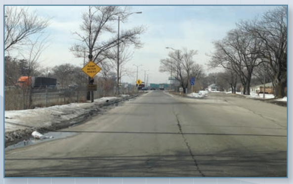
West Bound Entrance to 1-290 West of 17th Avenue at Harrison