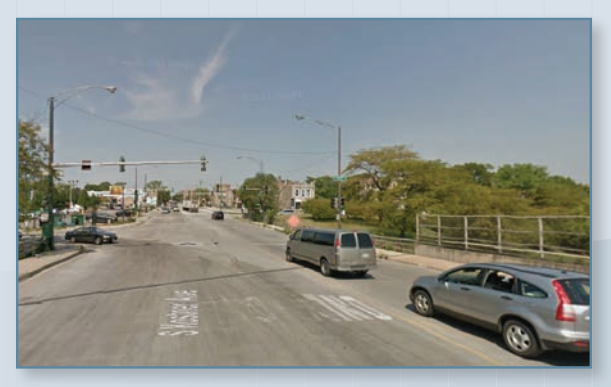
Kostner Avenue Looking North