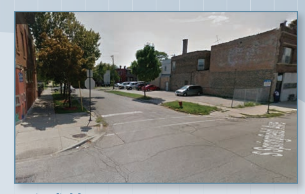
Springfield Avenue Looking South