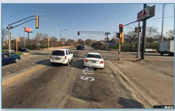
17th Avenue at I-290 Facing North towards I-290 Overpass