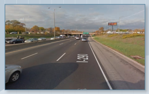
I-290 - East of First Avenue Facing West