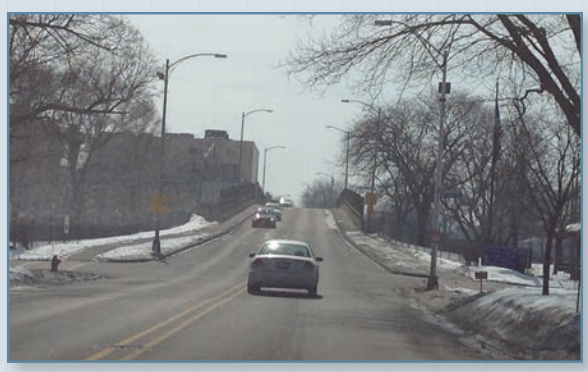
Circle Avenue Looking South over I-290