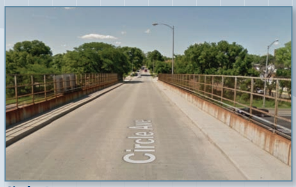
Circle Avenue Facing North over I-290