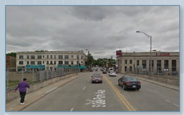
Oak Park Avenue Looking North