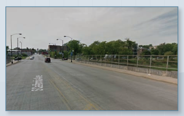
California Avenue Looking South