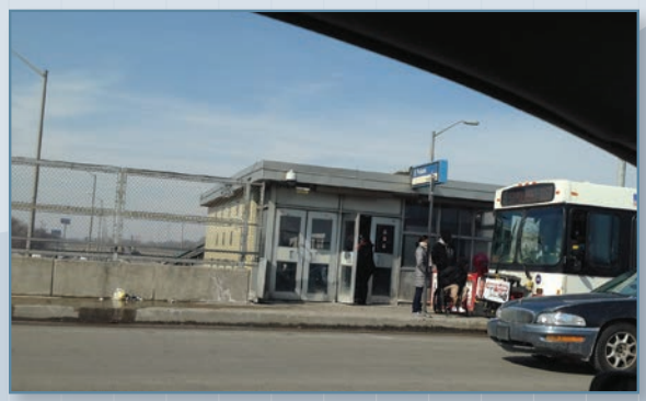
Pulaski Road over I-290