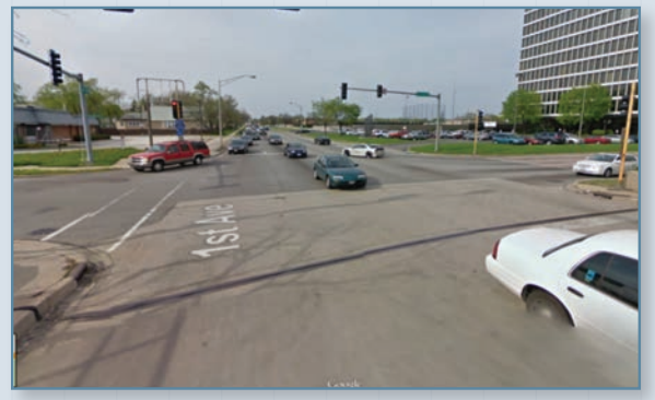
1st Avenue Facing North towards I-290 overpass