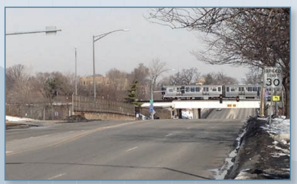
Des Plaines Avenue Looking North toward CTA Forest Park Terminal