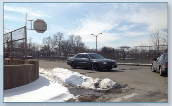
9th Avenue over I-290 Bridge, sidewalk and fence