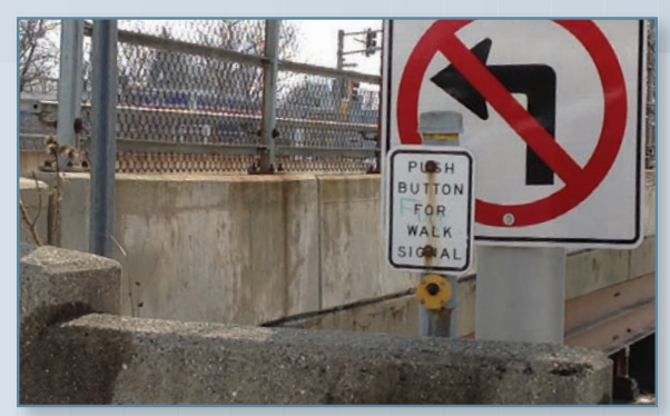
17th Avenue at I-290 Wall and Fencing