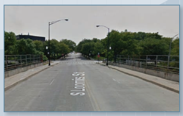
Loomis Street Looking South