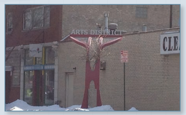
Harrison Avenue and Ridgeland Avenue Attraction Signage - Arts District