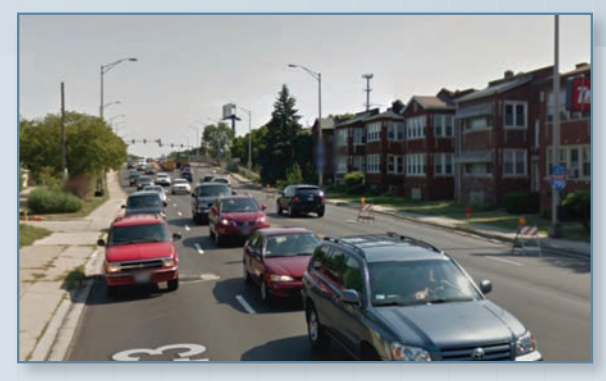
Harlem Avenue Facing South towards I-290 interchange