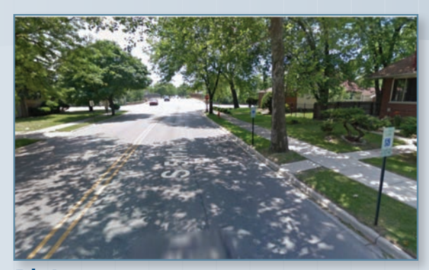
5th Avenue Facing South towards I-290 overpass