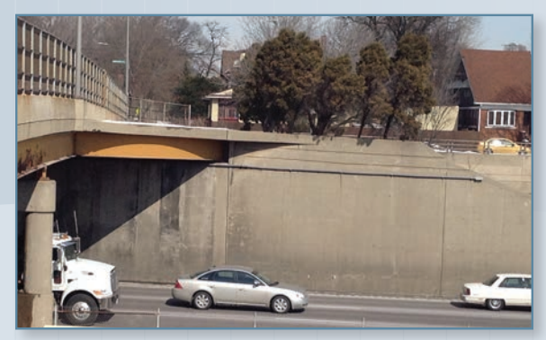
East Avenue I-290 Retaining Wall