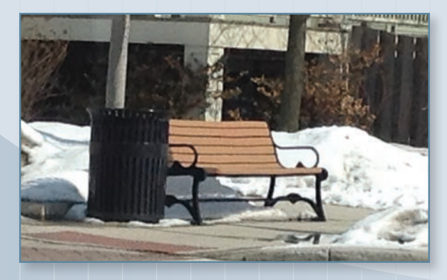
Trash Receptacle and Bench