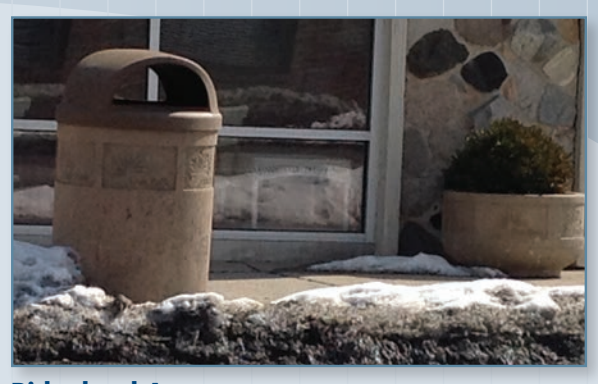
Ridgeland Avenue Trash Receptacle and Planter