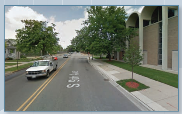
9th Avenue Facing North towards I-290 Overpass