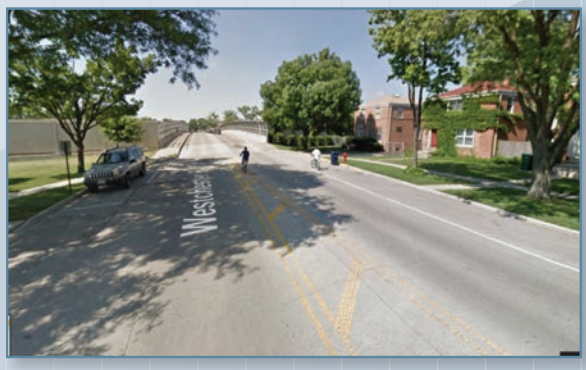
Westchester Boulevard Looking North towards I-290 overpass