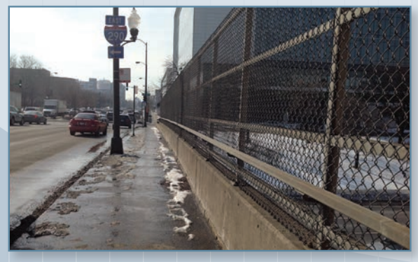
Ashland Avenue over I-290 Looking South - wall and fence