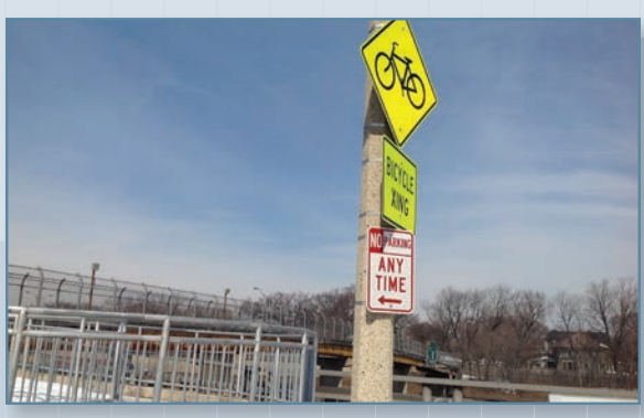
Home Avenue Pedestrian Bridge