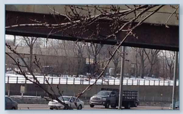
Circle Avenue Overpass - Wall and Fencing