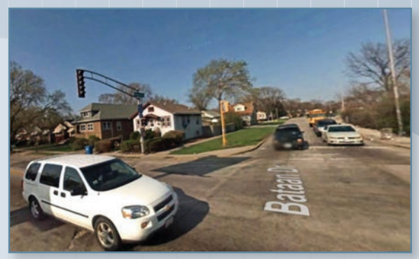
17th Avenue at I-290 Facing Southwest towards Bataan Drive