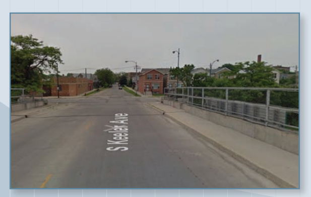
Keeler Road Looking South