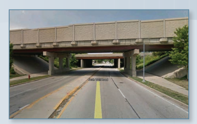
North Wolf Road Underpass at I-290 - Noise Wall