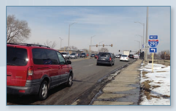
Harlem Avenue Looking North at East Side of Road