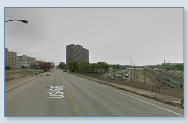
Ogden Avenue Looking South