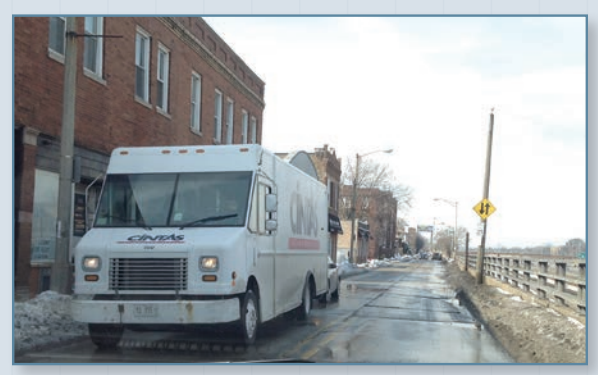
Oak Park and Garfield Narrow Streets - Parallel to I-290