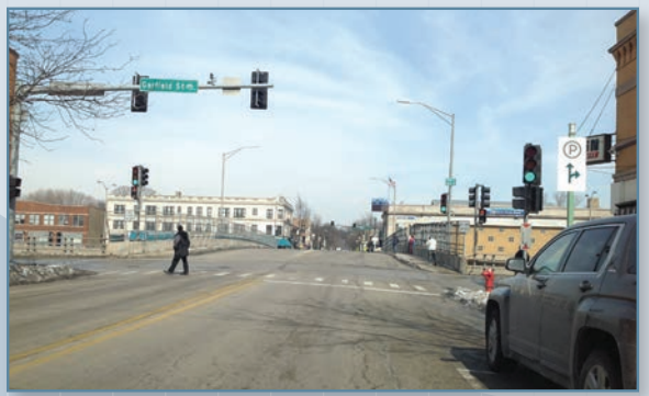
Oak Park Avenue and Garfield Looking North