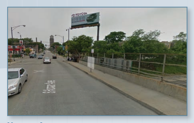
Homan Avenue Looking South