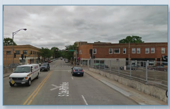
Oak Park Avenue Looking South