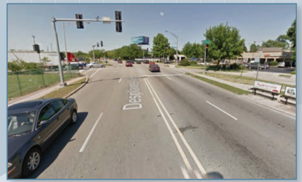
Des Plaines Avenue Facing North towards intersection of Harrison Street and I-290 off-ramp