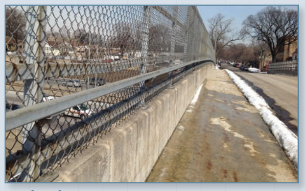
Lombard Avenue over I-290 Wall, fencing and sidewalk