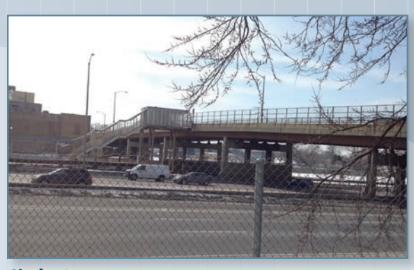
Circle Avenue - View From North Frontage