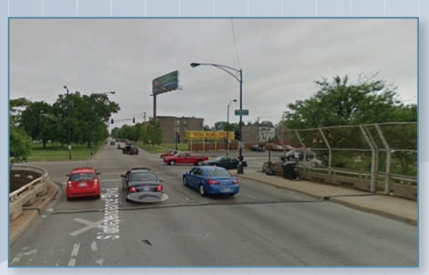
Independence Looking South