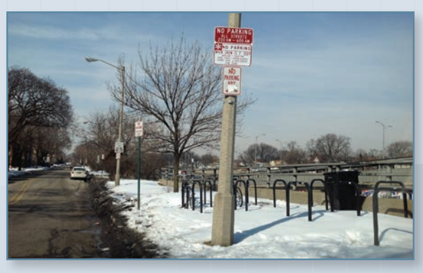
Austin Boulevard Bike racks and light poles