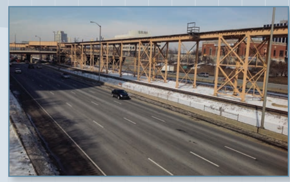
I-290 at Paulina Street Looking at West