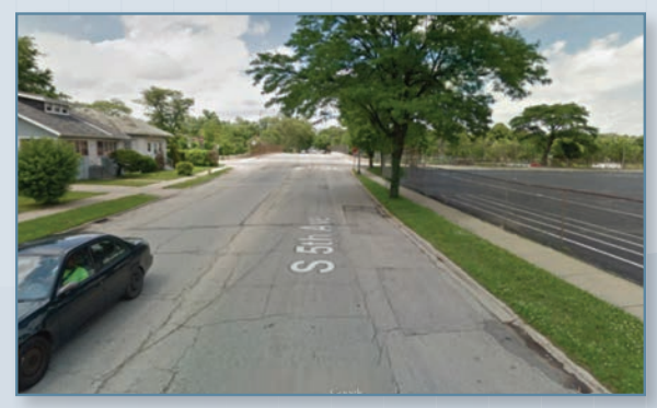
5th Avenue Facing North towards I-290 Overpass