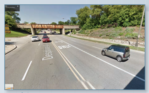
Des Plaines Avenue Facing North from I-290 Overpass