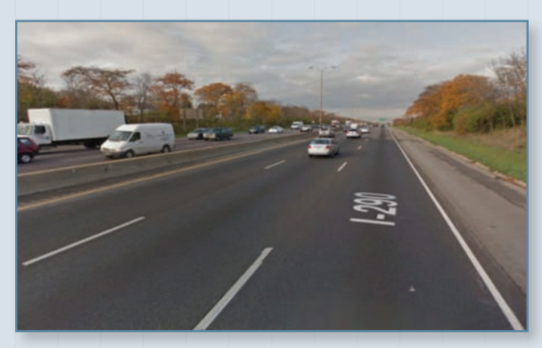
I-290 - Between 9th Avenue and 17th Avenue Facing West