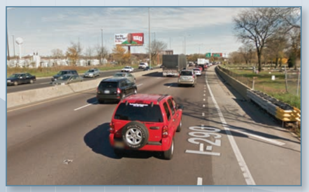
I-290 - Between 1st Avenue and Des Plaines Facing East