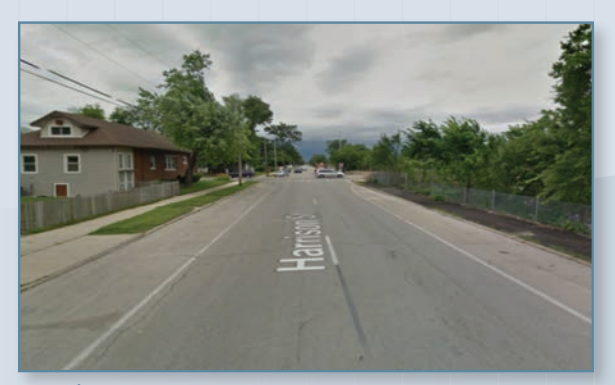
Harrison Street Facing East towards 9th Avenue intersection