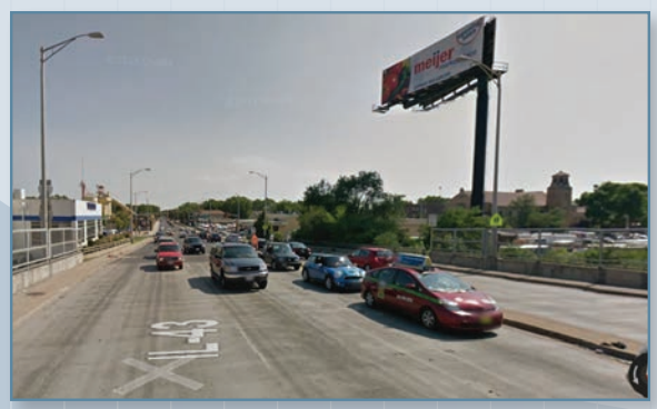
Harlem Avenue Looking South