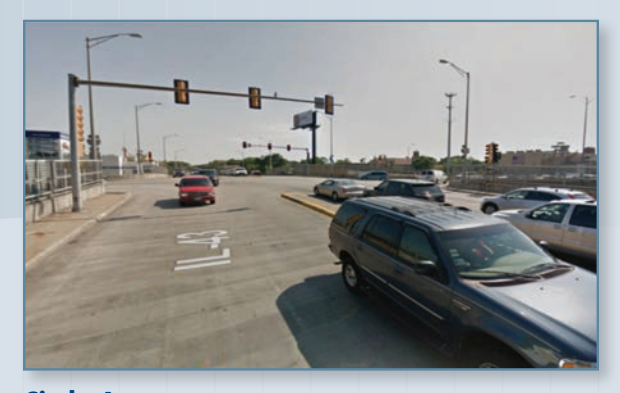
Circle Avenue Facing South - at interchange with I-290