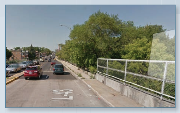
Harlem Avenue Looking North