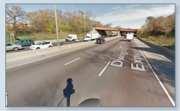
I-290 - Between Des Plaines River and CTA Bridge - Facing East