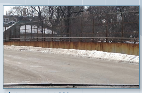
5th Avenue over I-290 Rusty wall and narrow sidewalk