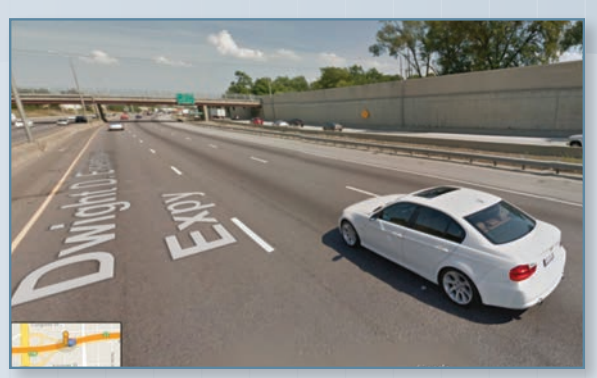
I-290 EB CD Road I-290 Looking East - Westchester Boulevard Overpass