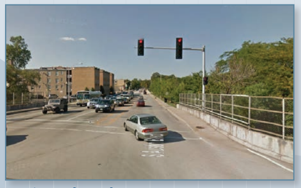
Austin Boulevard Looking North