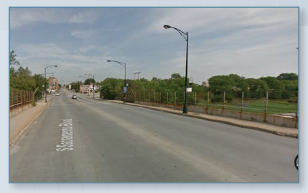
Sacramento Avenue Looking North