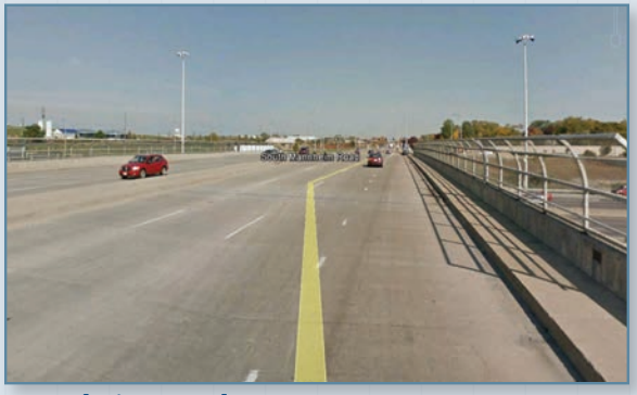
Mannheim Road Bridge, sidewalk and fence over I-290