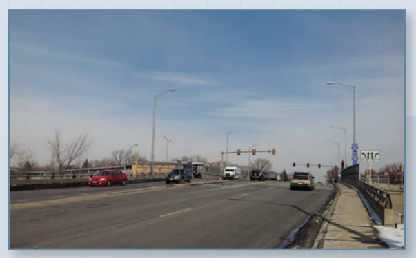
Harlem Avenue Looking North over Bridge/CTA Station