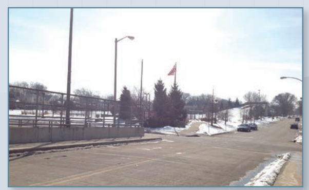
Lombard Avenue Looking South towards Barrie Park