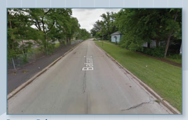
Bataan Drive Facing East towards 22nd Avenue