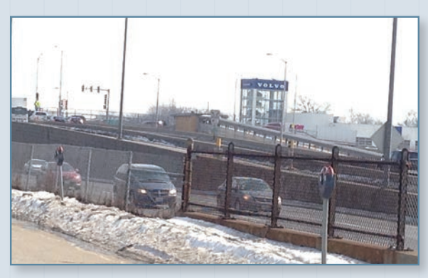
I-290 at Harlem Avenue