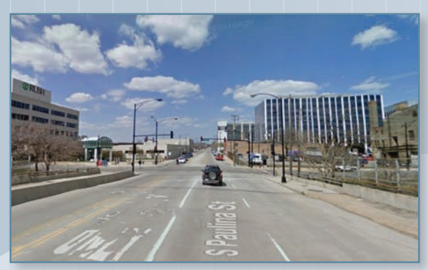
Paulina Street Looking North