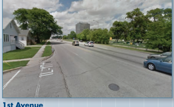
1st Avenue Facing Northeast towards I-290 overpass and cemetery