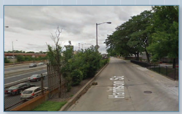
Harrison Street Looking East