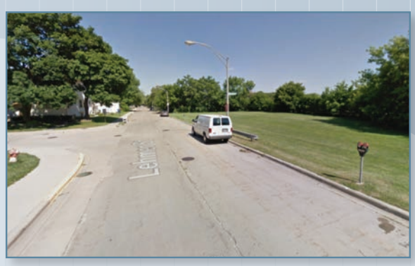
Lehmer Street - Facing East between Circle Avenue and Des Plaines Avenue