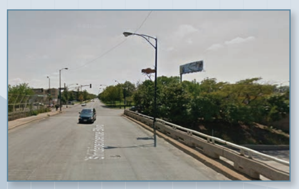
Independence Looking South