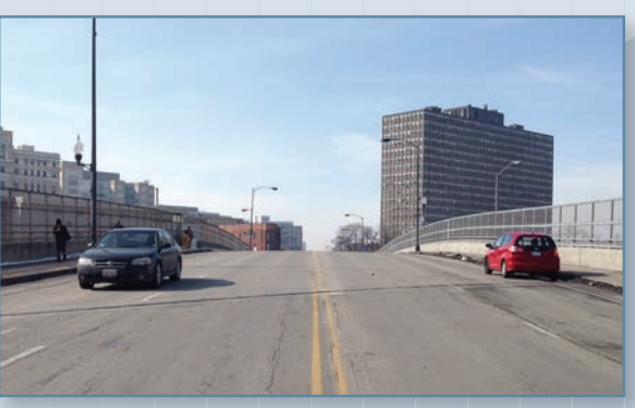
Ogden Avenue over I-290 Looking South - wall and fence