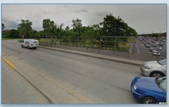
25th Avenue over I-290 Facing Southwest