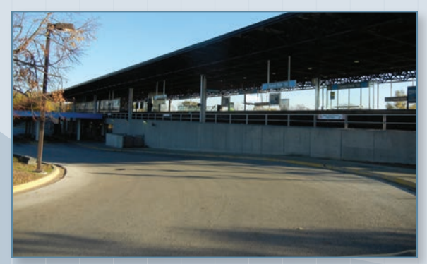
Transit Center - CTA Terminal