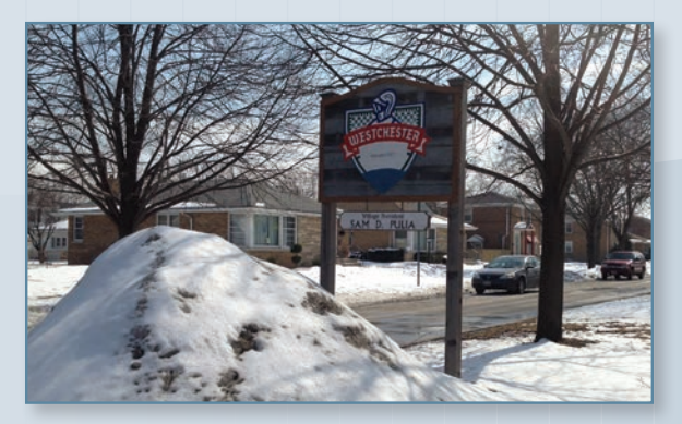
Westchester Welcome Signage