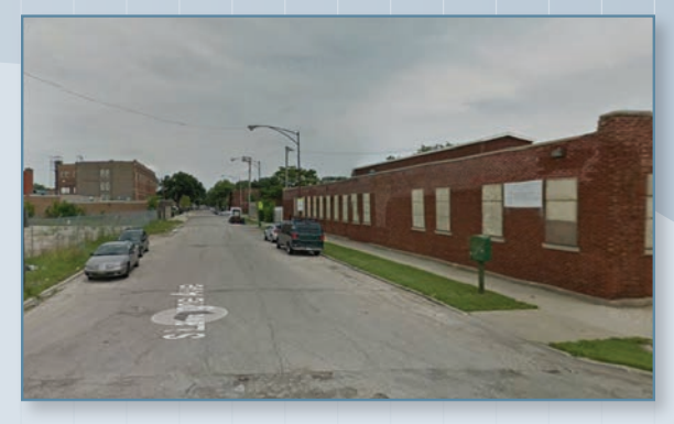
Lavergne Avenue Looking North