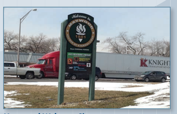
Maywood Welcome Sign