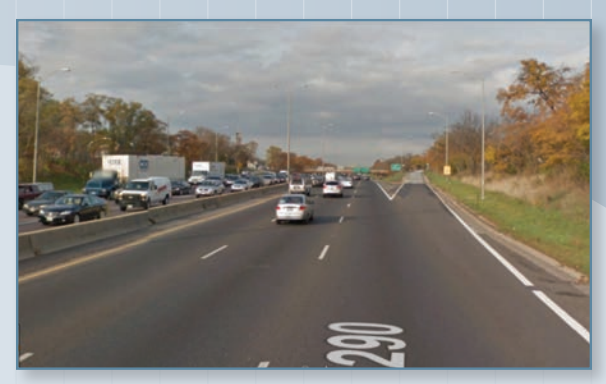
I-290 - Between 5th Avenue and 9th Avenue Facing West