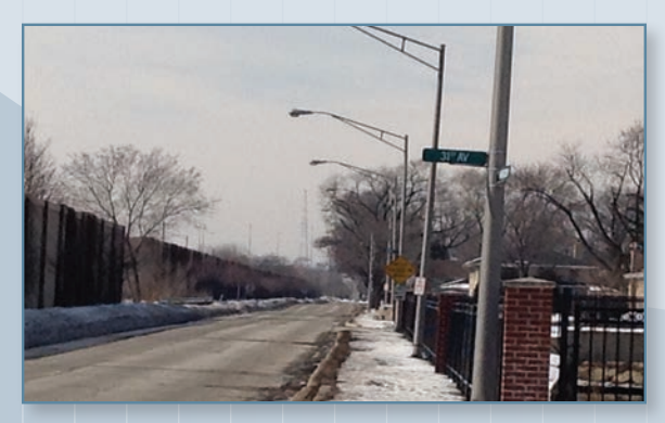
Harrison Street - Noise wall and fencing