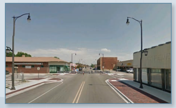
South 5th Avenue at Warren Street