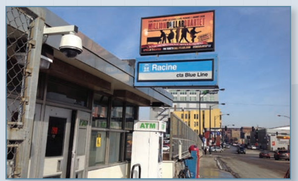
Racine Avenue over I-290