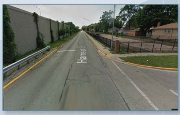
Harrison Street and Addison Street Noise Wall and decorative fencing