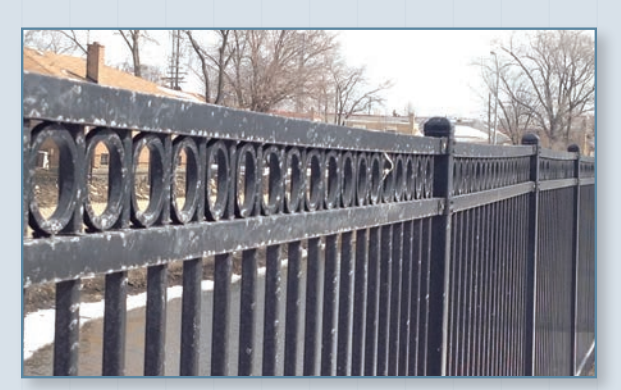
31st Avenue and Harrison Street North Side - Fencing along Addison Creek