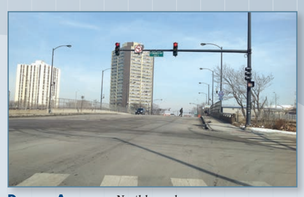
Damen Avenue - Northbound