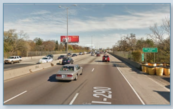
I-290 at Des Plaines River Crossing - Facing East