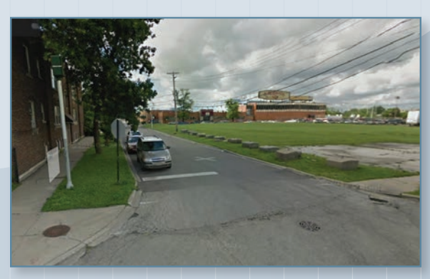
Lavergne Avenue Looking South