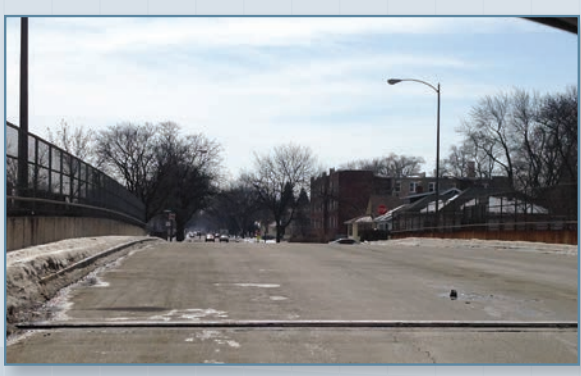
5th Avenue over I-290 Bridge, sidewalk, wall and fence