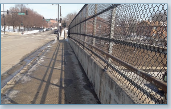
Loomis Street over I-290 Looking North - Wall and fence