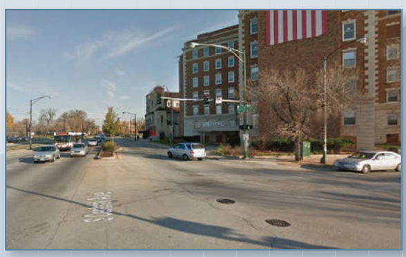
Central Avenue Looking North