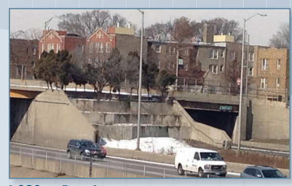
I-290 at East Avenue Terraced Area - I-290 Median