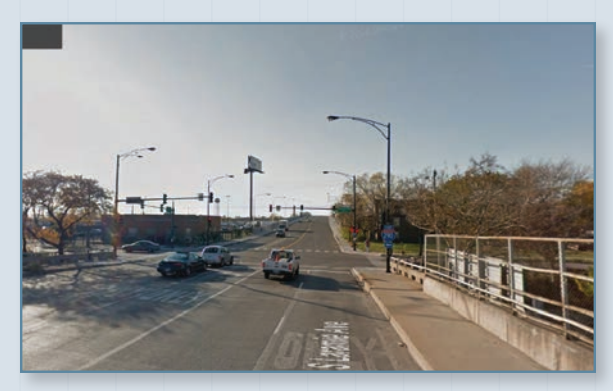
Laramie Avenue Looking South