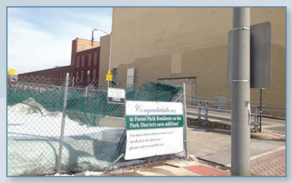
Circle Avenue New Park District grounds at South side of I-290 at Circle