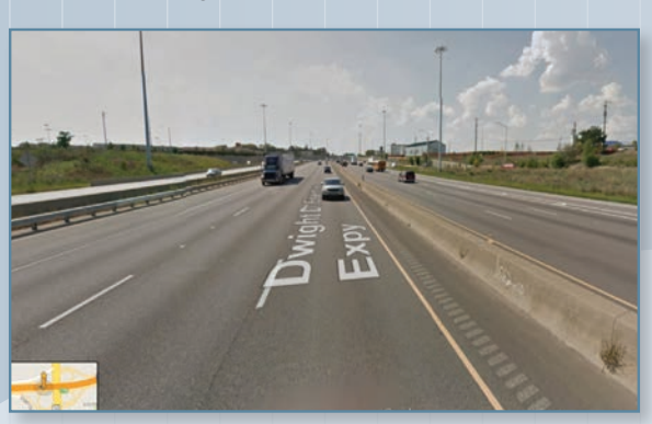
I-290 Looking West I-290 East side of Mannheim Road Interchange