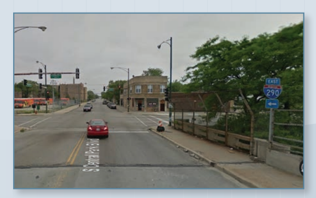
Central Park Boulevard Looking South