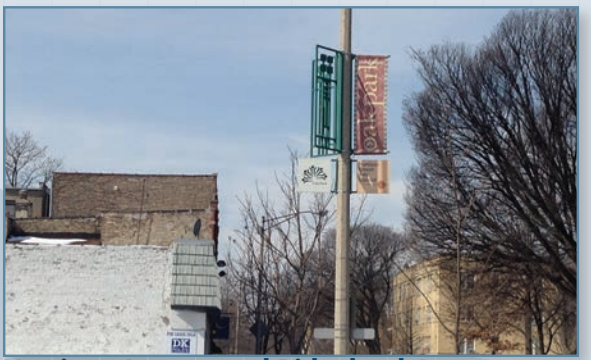
Harrison Avenue and Ridgeland Avenue Banner