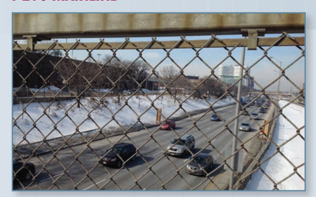
I-290 Racine Avenue Looking West from bridge