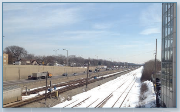
I-290 at Harlem Avenue Looking Northeast from Harlem Avenue