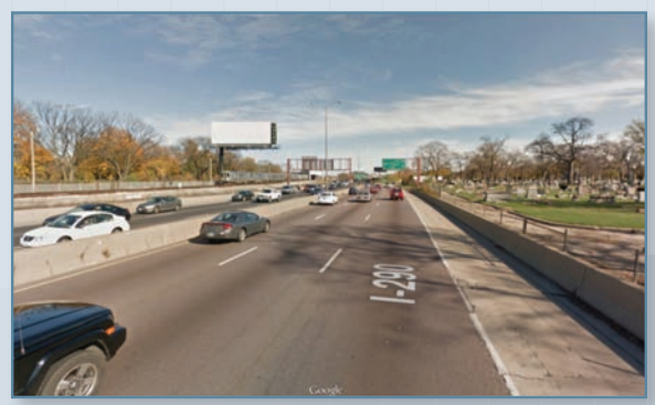
I-290 - Between Des Plaines River and Des Plaines Avenue - Facing East