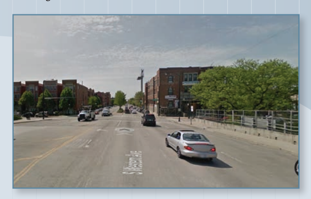
Western Avenue Looking South