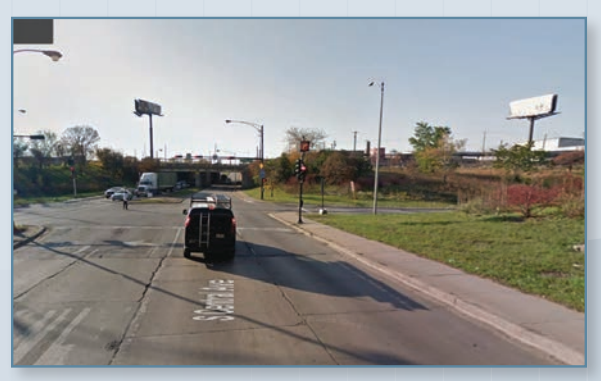
Central Avenue Looking South