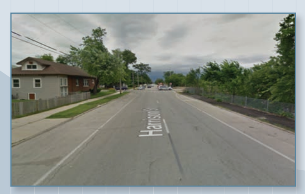
Harrison Street Facing West towards I-290 on-ramp near 1st Avenue