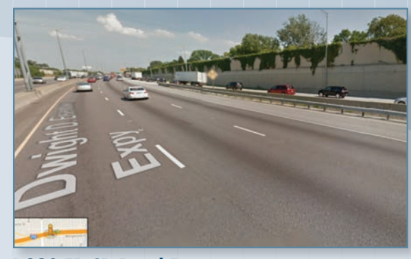
I-290 EB CD Road Entrance Noise walls along Wedgewood Drive