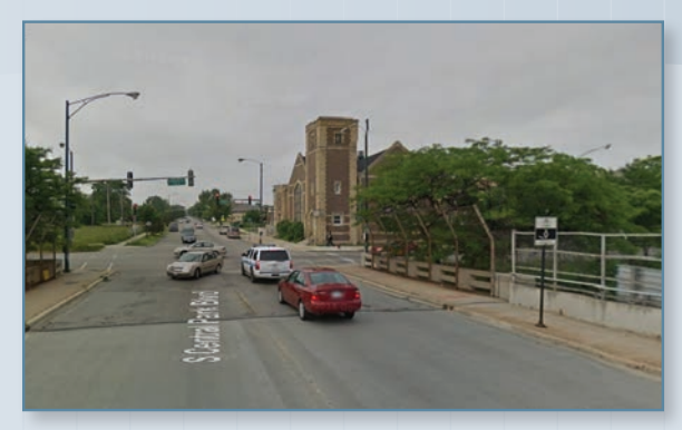
Central Park Boulevard Looking North