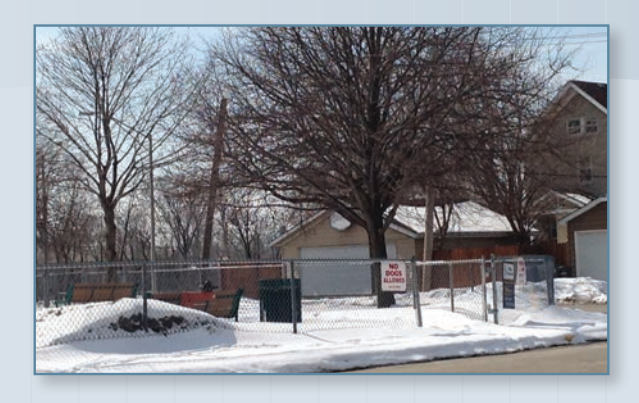
Circle Avenue at Lehner Street Northwest Corner - Park