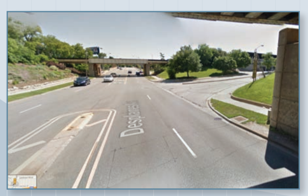
Des Plaines Avenue at Van Buren Street Facing South towards Van Buren Street