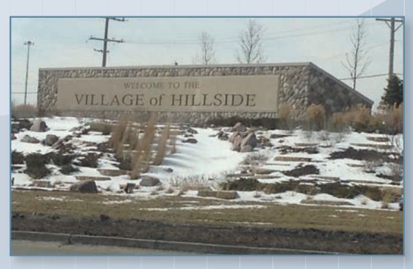
Mannheim Road Hillside Welcome Signage