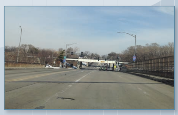
Des Plaines Avenue over I-290 Looking North, station, fence